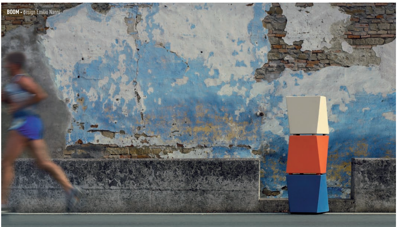
BOOM - design Emilio Nanni

From 16 th to 19 th JUNE, STEELMOBIL will be in Beirut, with our POUF BOOM in PROJECT LEBANON . We will be guests under the scope of the ITALIAN MARBLE SHOW organised by the National Foreign Trade Institute. Project Lebanon is the 14 th International trade show for construction, materials and construction equipment technology for the Middle East.