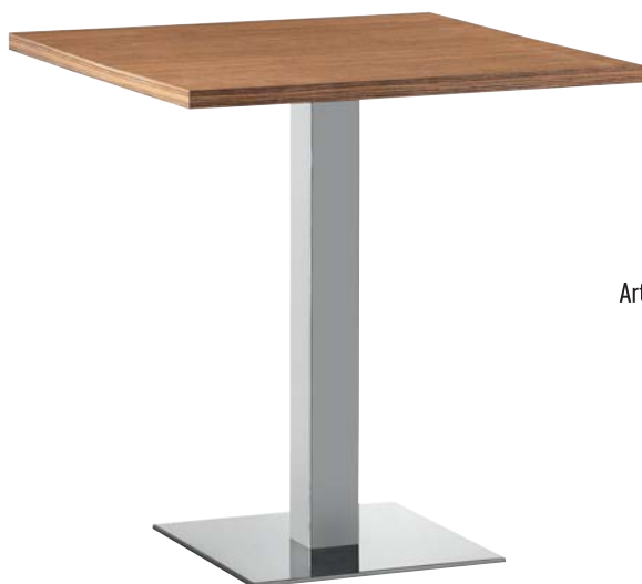
XT design Metalmobil Concept

Practical, versatile and never out of place, the Ibis seating collection includes a stacking chair with 4-leg frame, a stacking chair with sled base, chair with a central column, office chair, a barstool and a swivel barstool. Designed for indoor and outdoor use, the items in the Ibis collection have bodies made of PP+PET (polypropylene + polyethylene terephthalate), a variable-density multilayer engineering composite, non-toxic and 100% recyclable, resistant to shocks, detergents, alcohol and UV radiation. Ibis is available in white, ivory, orange, pearl grey, yellow and in the new green and anthracite grey.