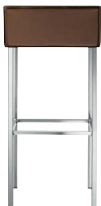
TWIN design Metalmobil Concept

TWIN is a stool with clean and straight lines, comfortable, practical and easy to handle, and just as easy to insert in any décor solution. The Twin stool is available in the low 48-cm version as well (article 369).